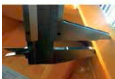
6 mm Thickness