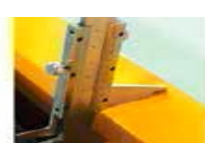
16 mm Thickness