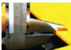
4 mm Thickness