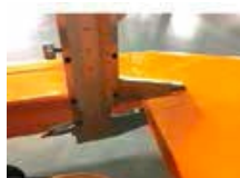
8 mm Thickness