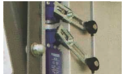
Double Limit Switch