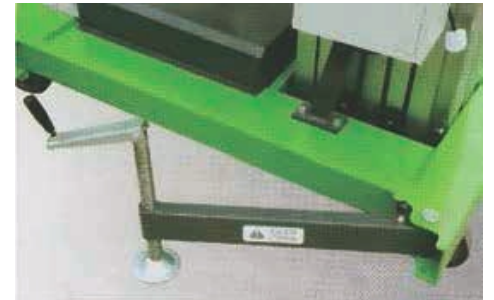
Screw Type Outriggers