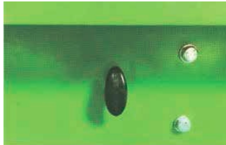
Auxiliary Lowering Device